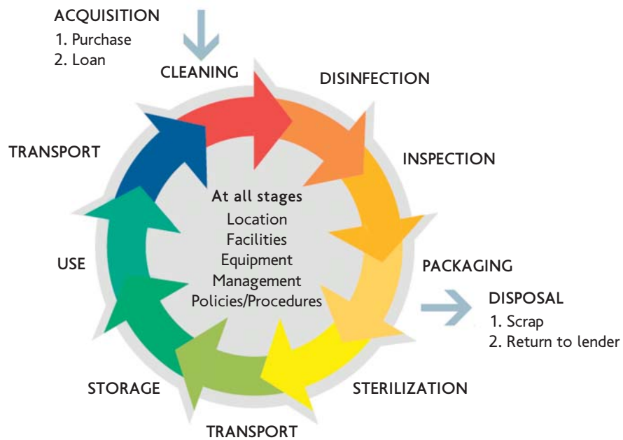
Figure 3.3.2. The cycle of decontamination of a reusable surgical instrument

Reproduced with permission from reference 14.