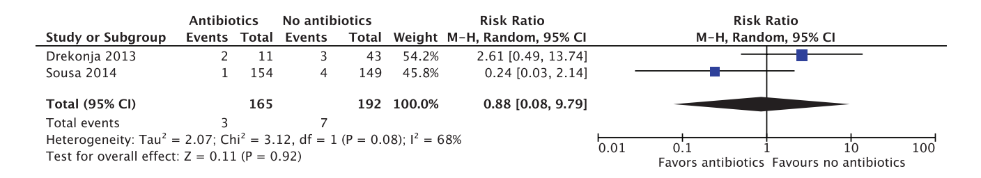
Figure 2. A , Risk of prosthetic joint infection in patients treated vs not treated for asymptomatic bacteriuria in patients undergoing orthopedic surgery. B , Risk of symptomatic urinary tract infection in the postoperative period in patients treated vs not treated for asymptomatic bacteriuria in patients undergoing orthopedic surgery. Abbreviations: CI, confidence interval; M-H, Mantel-Haenszel.

prophylaxis active against the preoperative ASB strains. However, there is insufficient evidence to address whether the common strategy of expanding perioperative prophylaxis to include coverage of the ASB organism has any benefit.